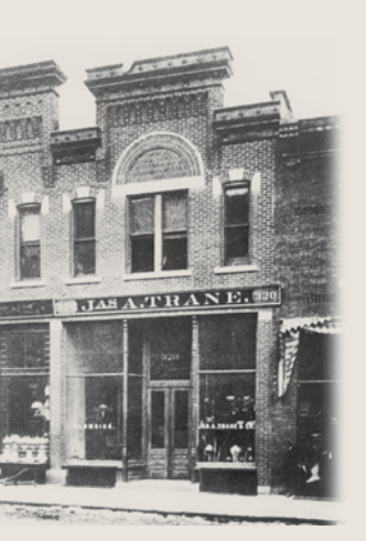
Trane Storefront La Crosse, Wisconsin 1891