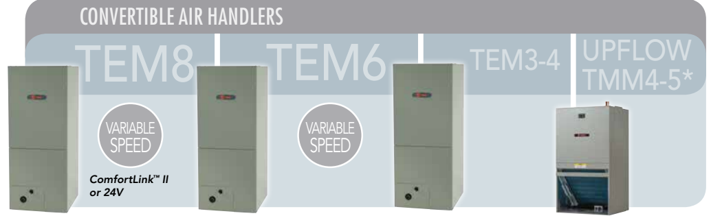
* The TMM4 and TMM5 air handlers are Upflow Only for use in wall, stud, or over the water heater applications.