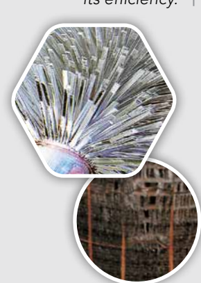
Conventional exposed plate fin stands little chance in harsh environments.

Exclusive Spine Fin™ Coil technology comes standard in every Trane outdoor product. No other heat exchanger has been able to beat its efficiency.