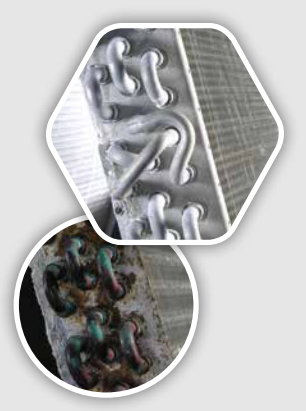
Traditional copper and galvanized steel coils are highly susceptible to corrosion.

Trane's Industry-First All Aluminum Comfort™ Coils are revolutionary in an industry tied to copper, which means longer life and industry leading resistance to corrosion.