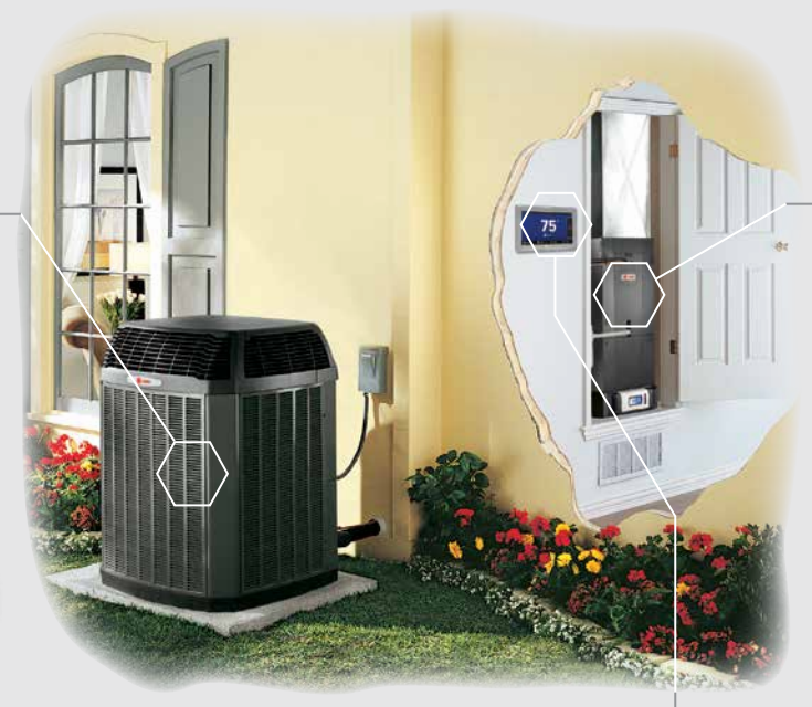
Exclusive Trane Nexia<sup>™</sup>-Enabled Controls help manage your home comfort from wherever you happen to be. They can also easily control over 400 compatible Z-Wave<sup>®</sup> devices like door locks, lighting, garage door openers and window openers.